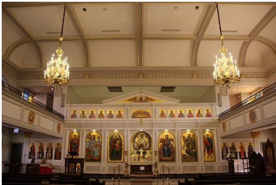
St. Basil Altar Screen 2019