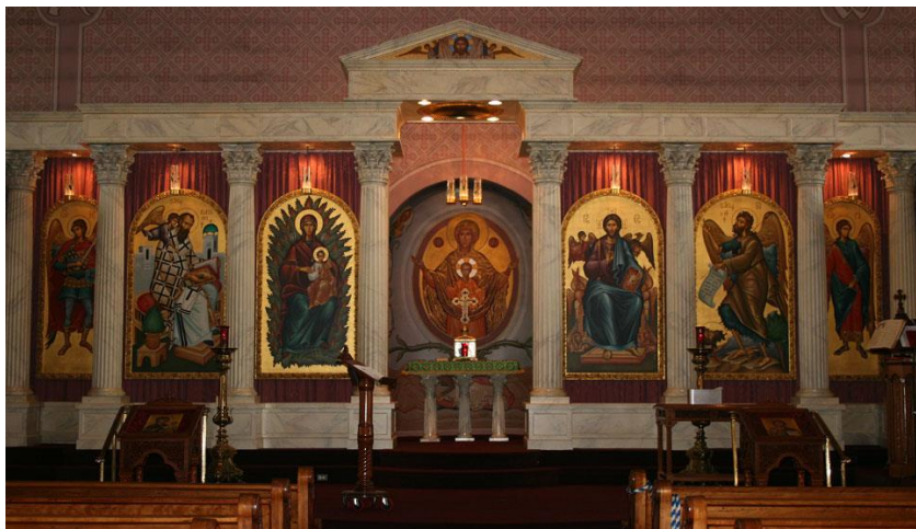
St. Basil Altar Screen 2010